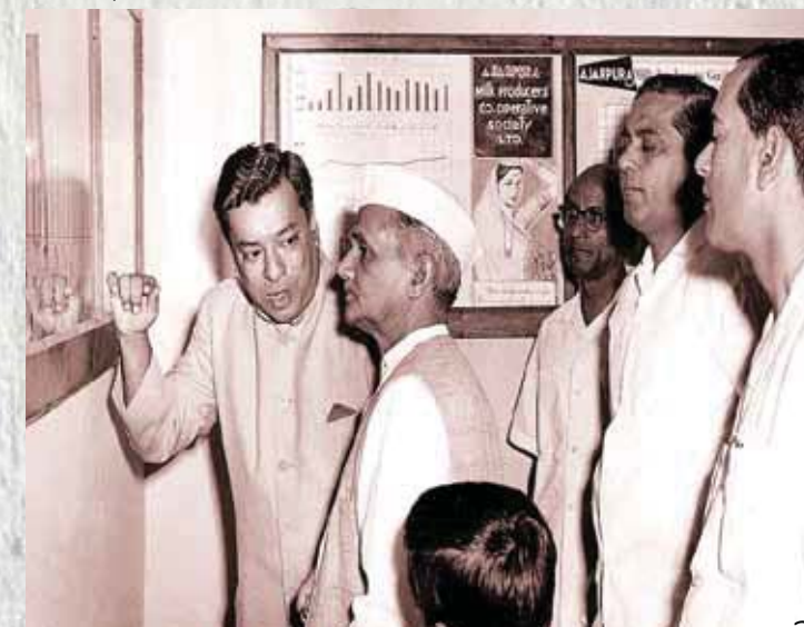
A rare picture of Dr. Kurien from 1964

Operation Flood was first tried and tested through the Anand pattern experiment at Amul. It was a three-tiered structure, which focused solely on establishment of a direct