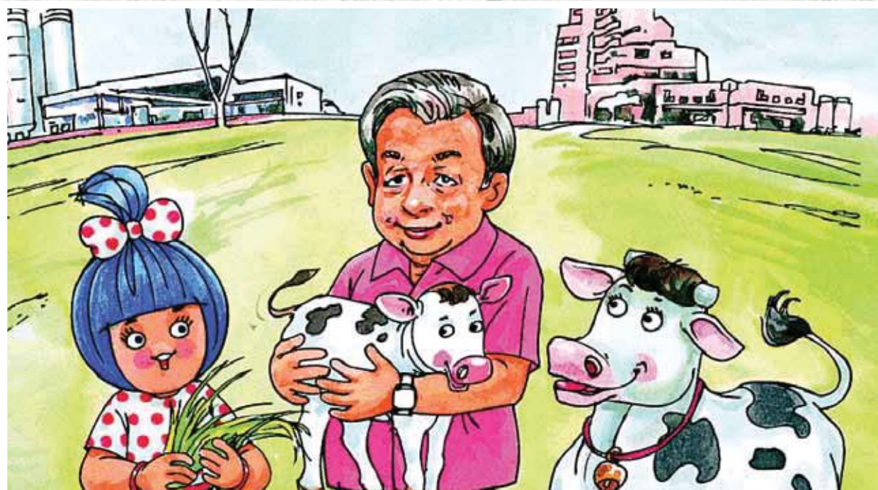
The Amul girl and her creator