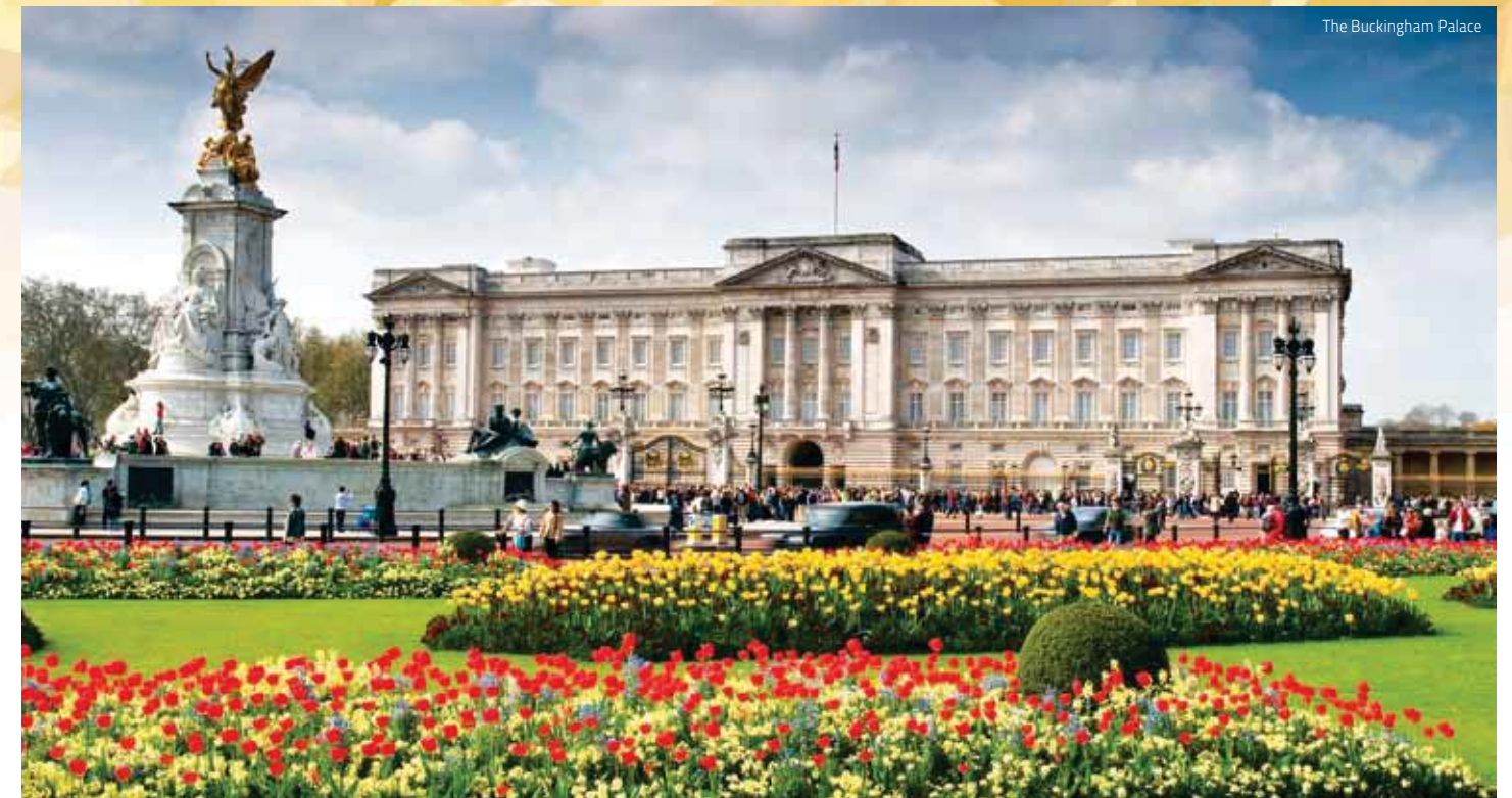
The Buckingham Palace