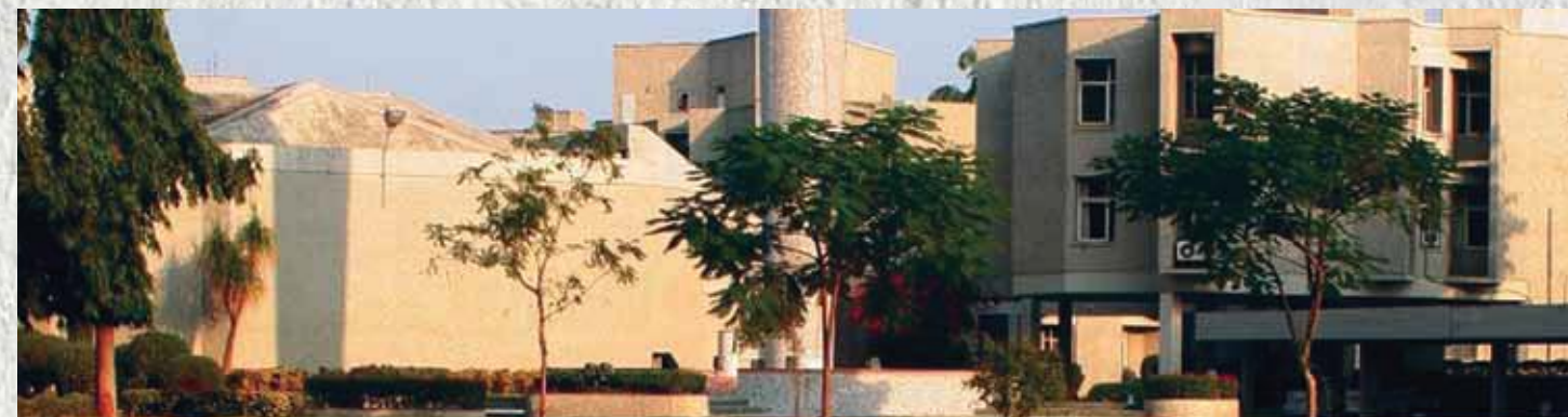
Institute of Rural Management Anand (IRMA) was established by Dr. Verghese Kurien in 1979

The late Dr. Verghese Kurien was a great man with an even greater vision—a vision to empower the rural India. Accredited as the Father of the White Revolution in India, Dr. Kurien was a social entrepreneur, who very famously said that, 'I am in the business of empowerment. Milk is just a tool in that.'